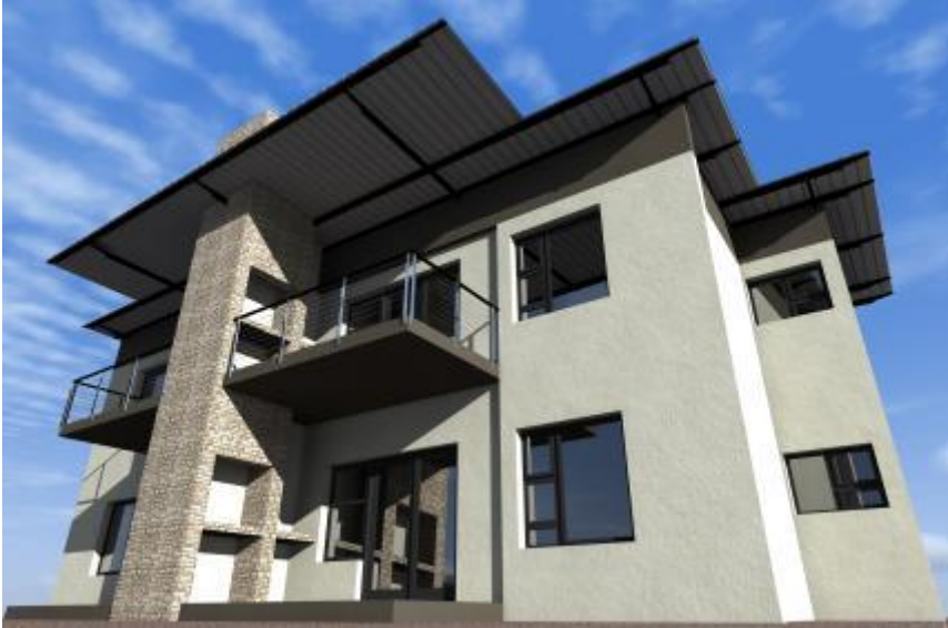
The rental income from each one of these blocks will fund a Namibian staff member in perpetuity