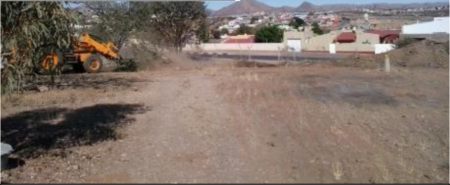
Work to clear the land for the first block began in June 2103